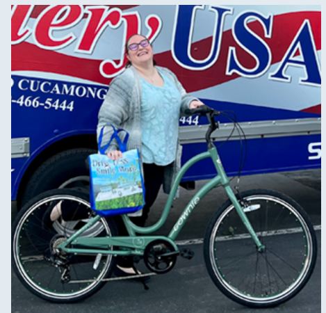
IE Commuter's lucky prize winner with her new bike, courtesy of Cyclery USA, Redlands

Although Rideshare Week 2021 is over, ridesharers can still qualify to win $100 gift card prizes in the Monthly Rideshare Spotlight drawing by logging their commutes at IECommuter.org .