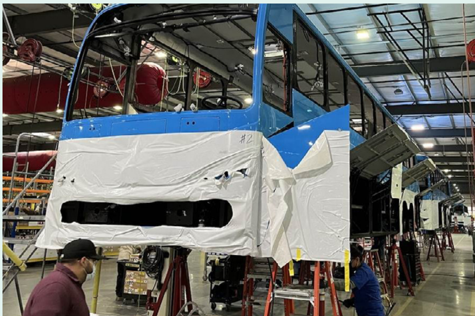
Pictured here: One of the new electric buses getting painted and ready to roll soon.

Ventura County Transportation Commission (VCTC) will soon be rolling out five new electric buses in partnership with Santa Barbara County. The buses are fully electric and part of VCTC's commitment to clean air efforts.