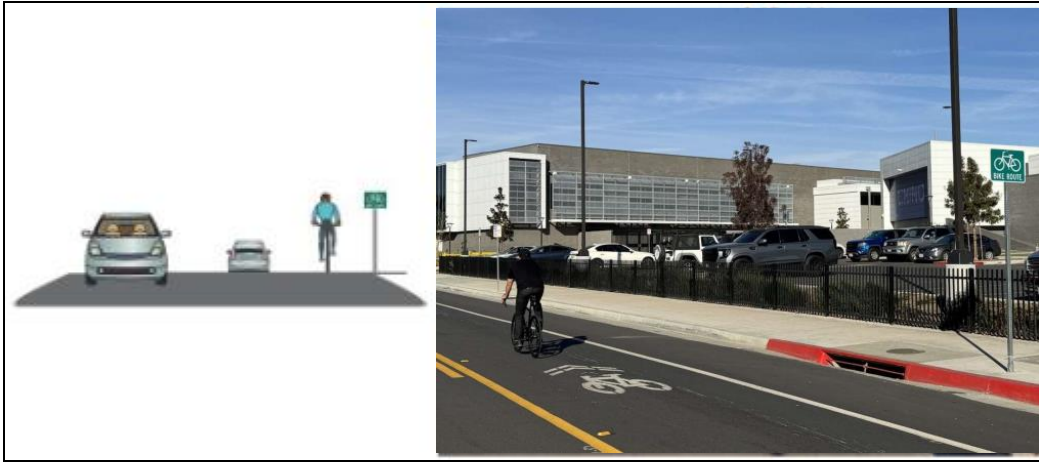
Figure 5: Class III Example showing a section of the City of Chino's completed project