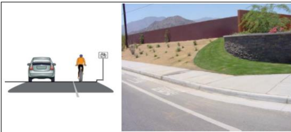
Figure 4: Class II Example