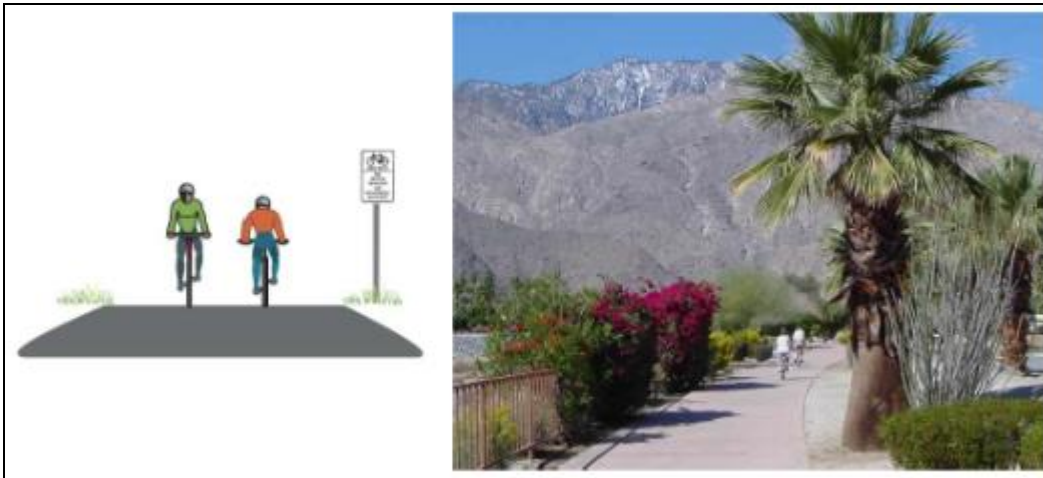
Figure 3: Class I Example