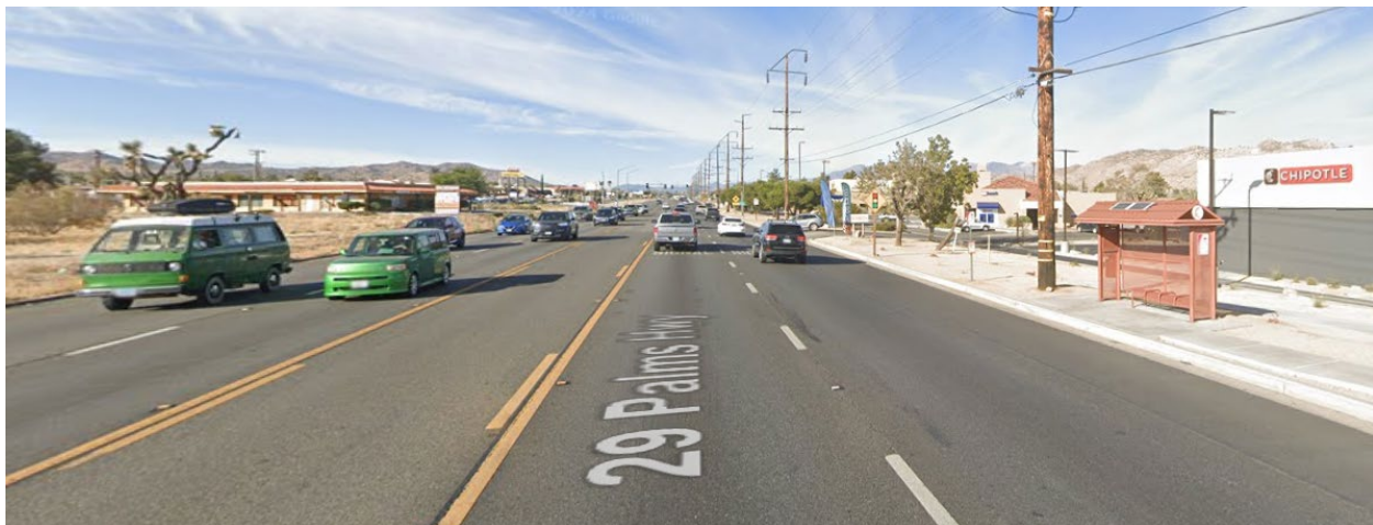
Figure 2. SR 62 Looking Westbound, East of SR 247

On the following page Table 1 outlines how the 360° for 960 Implementation Plan will help Caltrans meet SB 960 obligations while going above and beyond to ensure obligations are met in a meaningful way that will maximize the long-term benefits of the effort.